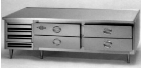
MODEL LHR-60-4D-EM SHOWN WITH OPTIONAL MARINE EDGE TOP