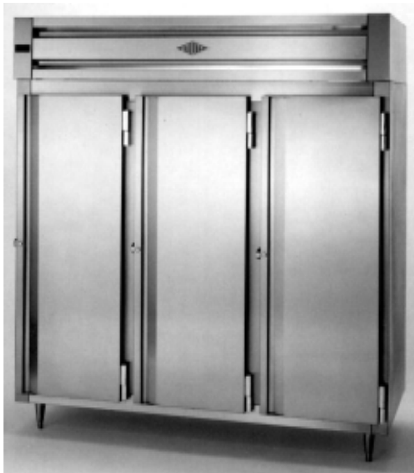
MODEL F-90-SS-3S-D SHOWN WITH OPTIONAL HINGING (LEFT DOOR HINGED RIGHT)