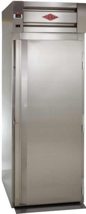
RIHC-30-SS-1S-L 30" Wide, Stainless Steel (shown with optional 12" high top-mount)