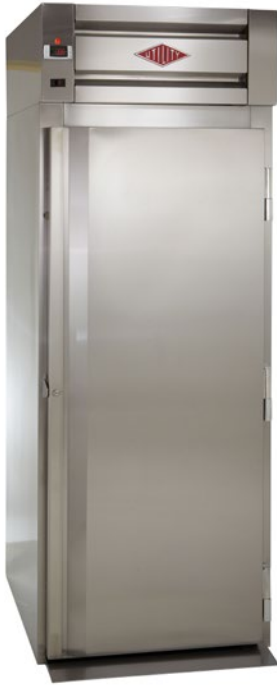
RIHC-30-SS-1S-H 30" Wide, Stainless Steel (shown with optional 12" high top-mount)