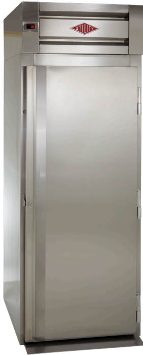
RIF-30-SS-15-H 30" Wide, One Narrow Door, S/S Exterior and Interior