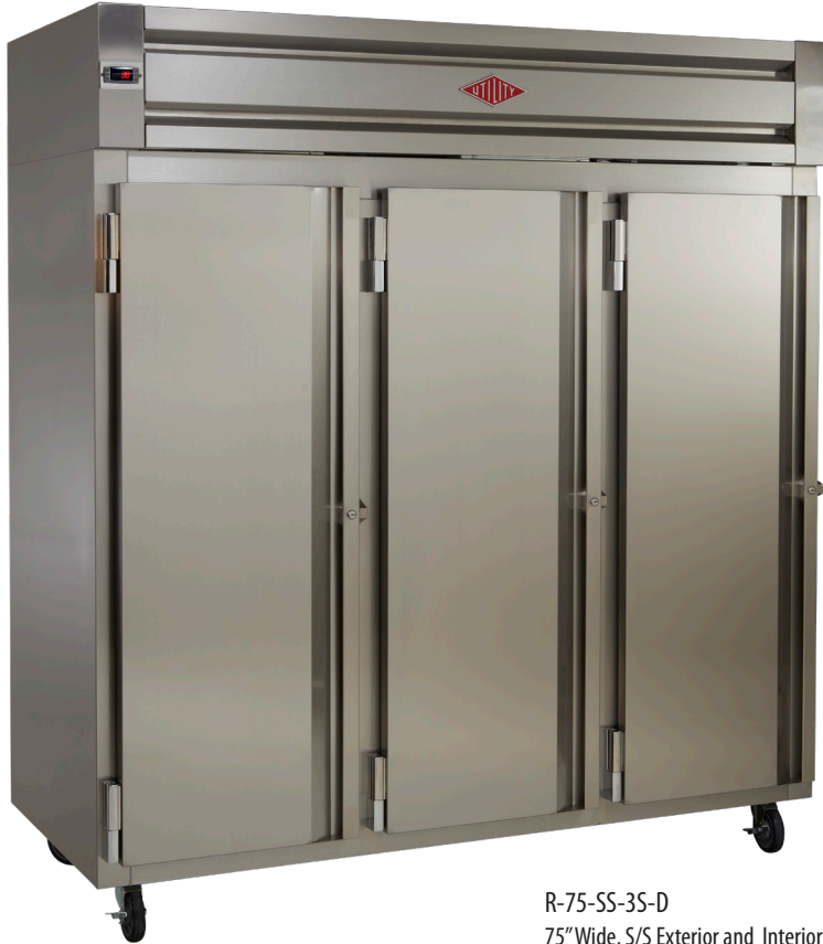
R-75-SS-3S-D 75" Wide, S/S Exterior and Interior