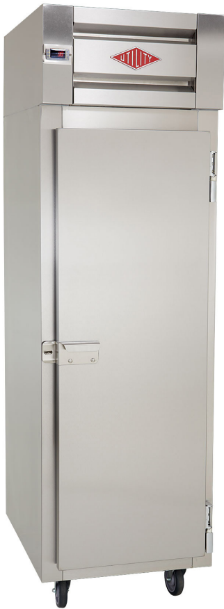
R-25-SS-1S-D 25" Wide, S/S Exterior and Interior (shown with optional correctional package)