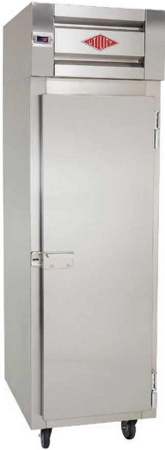
R-25-SS-1S-D 25" Wide, S/S Exterior and Interior (shown with optional correctional package)