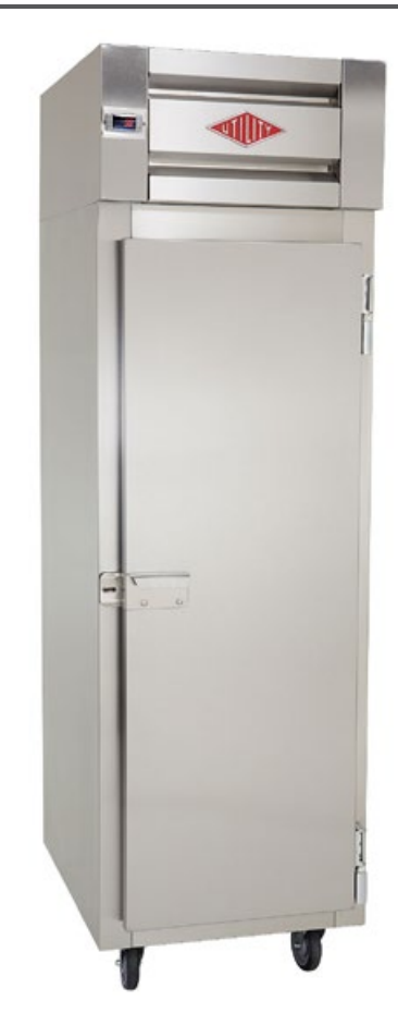
R-25-SS-1S-D 25" Wide, S/S Exterior and Interior (shown with optional correctional package)