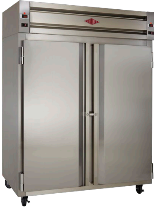
HC-60-SS-2S-D 60" Wide, Stainless Steel Exterior and Interior (shown with optional 12" high top-mount)