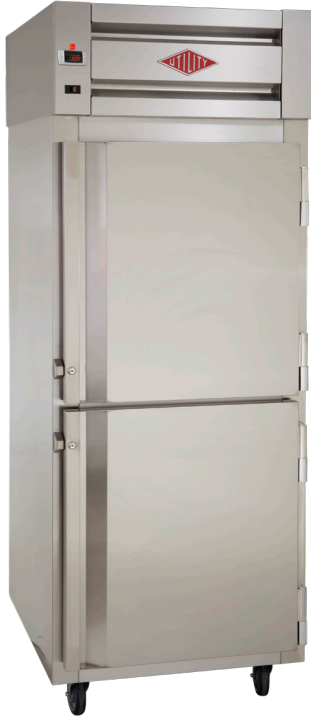
HC-30-SS-2S-D 30" Wide, Stainless Steel Exterior and Interior, half height doors (shown with optional 12" high top-mount)