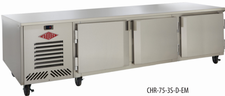
CHR-75-3S-D-EM 93" Overall Width, Three Doors (shown with optional stainless steel flat top)