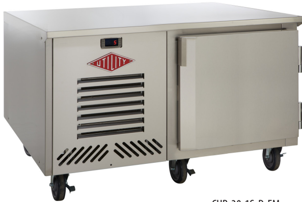
CHR-30-1S-D-EM 48" Overall Width, One Door (shown with optional stainless steel flat top)