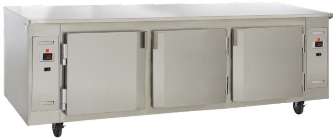
CHHC-90-3S-D 102" Wide, S/S Exterior and Interior