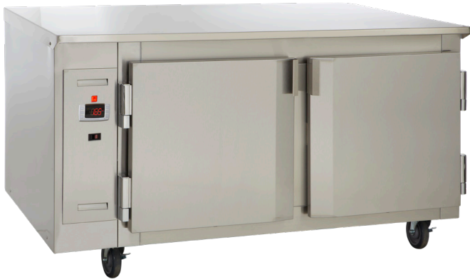
CHHC-60-2S-D 66" Wide, S/S Exterior and Interior