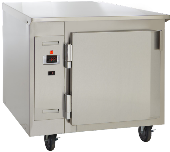
CHHC-25-1S-D 31" Wide, S/S Exterior and Interior