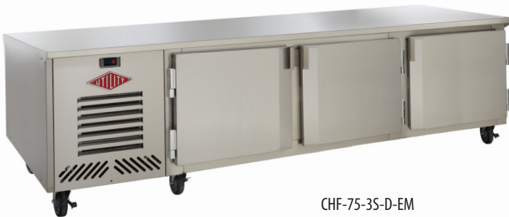
CHF-75-3S-D-EM 93" Overall Width, Three Doors (shown with optional stainless steel flat top)