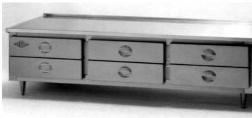
MODEL LHR-102-6D SHOWN WITH OPTIONAL MARINE EDGE TOP