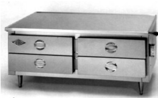
MODEL LHR-60-4D SHOWN WITH OPTIONAL MARINE EDGE TOP AND RIGHT SIDE STUB OUTS