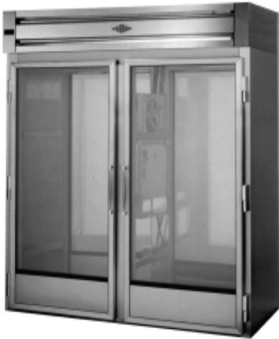
MODEL RTR-75-SS-2G-2G SHOWN WITH OPTIONAL GLASS DOORS