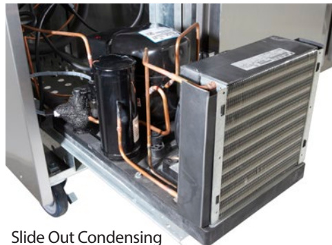
Slide Out Condensing Unit for Easy Maintenance