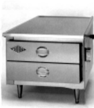
MODEL LHR-30-2D SHOWN WITH OPTIONAL MARINE EDGE TOP AND RIGHT SIDE STUB OUTS