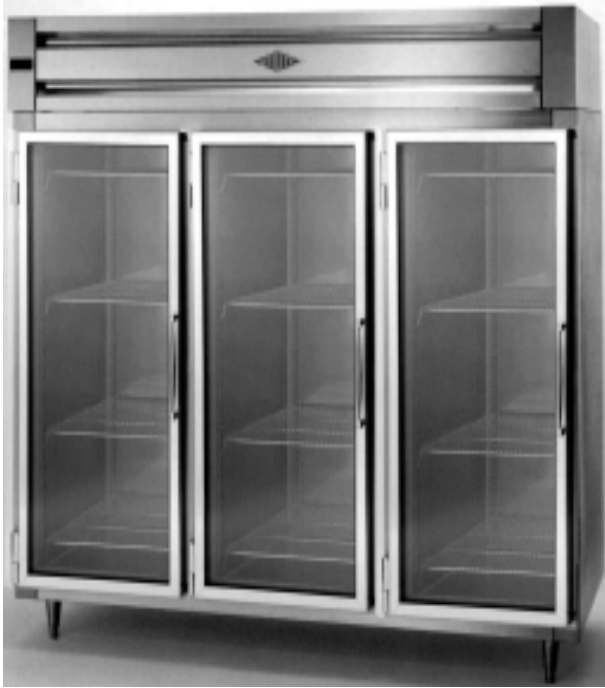
MODEL F-75-SS-3G-D SHOWN WITH OPTIONAL HINGING (CENTER AND RIGHT DOORS HINGED LEFT)